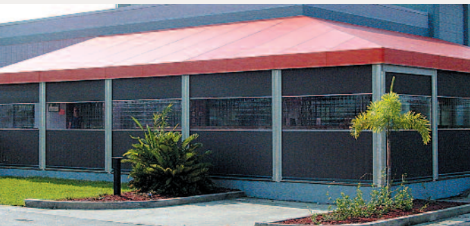
Keep the heat in