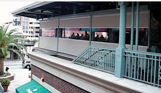
Increase Revenue in Bad Weather

Mirage Motorized Screen Systems' specially designed mid zipper rail allows us to use a 27" heavy vinyl insert with Shearweave 2100 privacy mesh to provide a comfortable and profitable solution to inclement weather conditions.