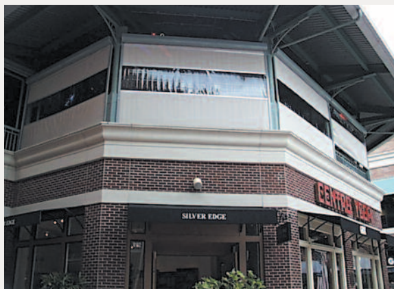
Keep rain and wind out